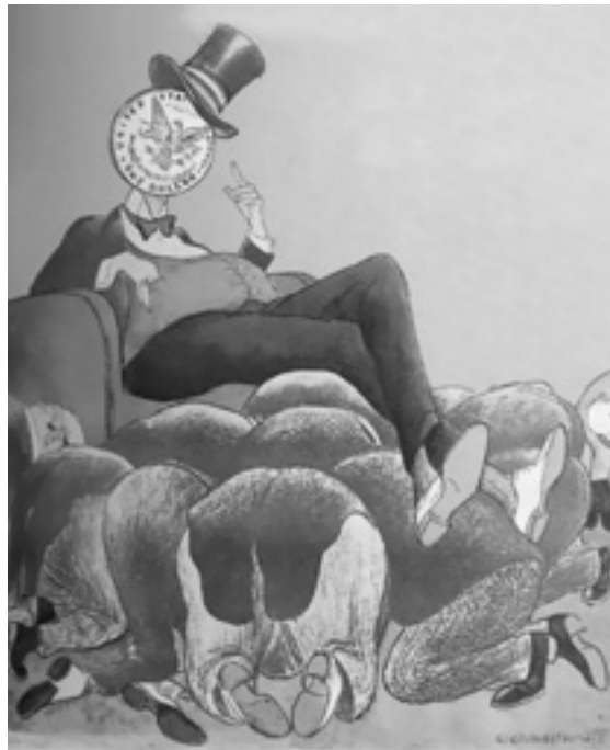
A Soviet cartoon published in 1947. The figures kneeling represent the European countries. They are kneeling in front of the US dollar.