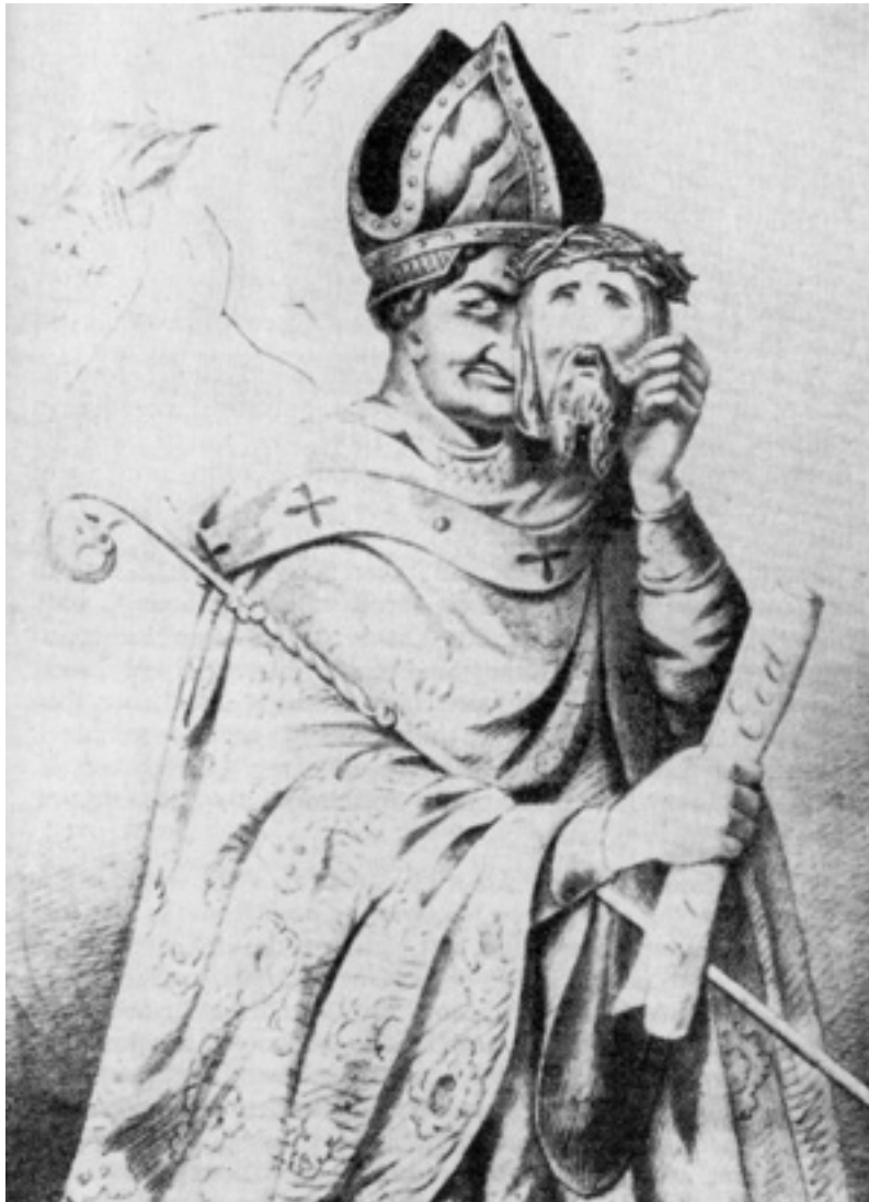
A cartoon drawing of Pope Pius IX from 1852.